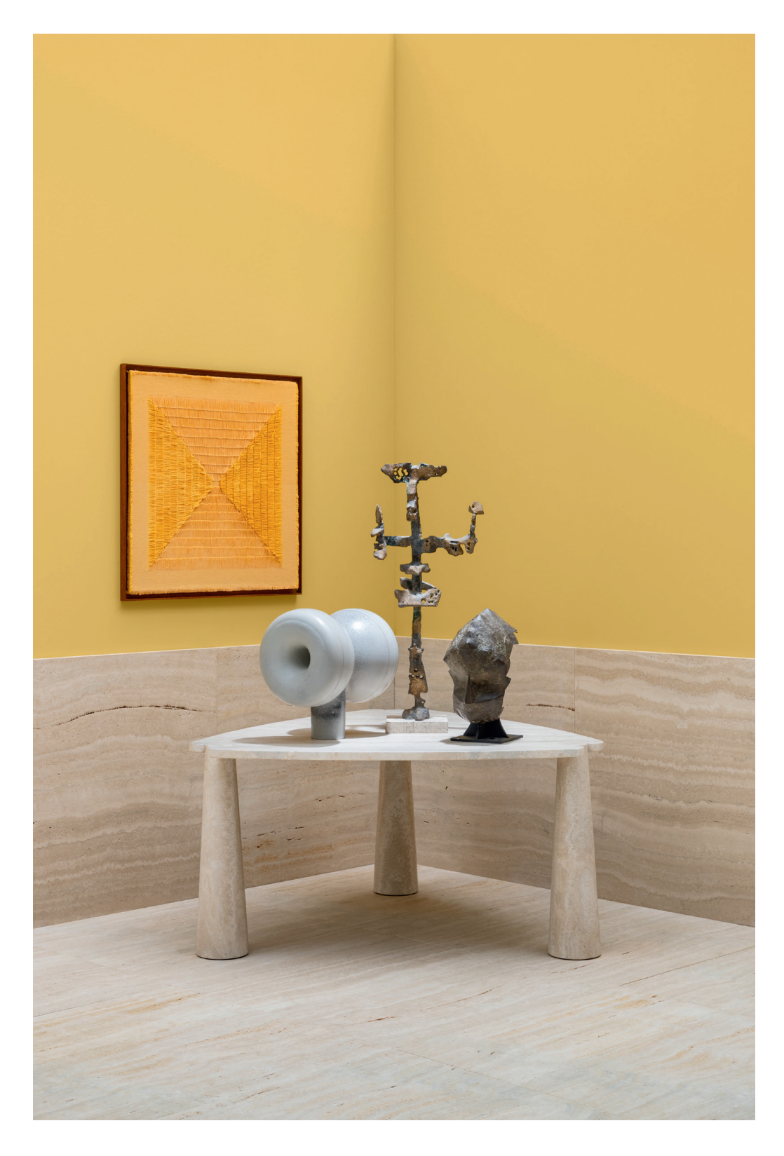
A fusion of ancient Roman influences and contemporary subversions forms the domus of our dreams

Creative direction NICK VINSON