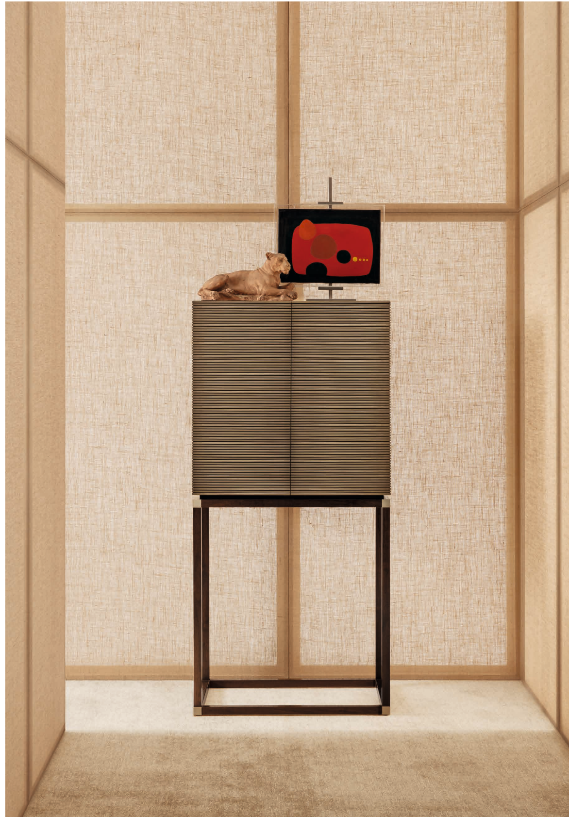
Above, a 'Riesling' bar cabinet, by Armani Casa, with terracotta lioness sculpture (19th century), by an unknown artist (Brun Fine Art, Milan), and Untitled (1959), by Paolo Scheggi (private collection, courtesy Robilant + Voena, Milan)