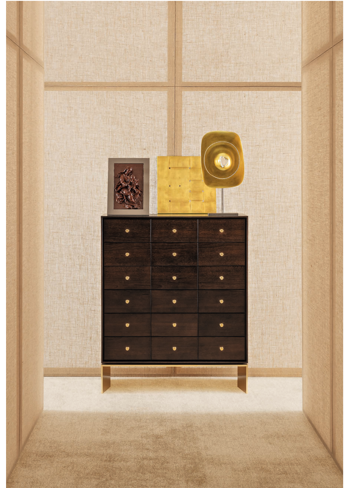
Opposite, an 'Open' sofa, 'Ninfea' table and 'Logo Mini' lamp, by Armani Casa, with (behind sofa) Kleenex (1974), by Luciano Bartolini (private collection, courtesy Robilant + Voena, Milan), and (on table) terracotta sculpture (1963), by Michelangelo Barbieri (Dei Bardi Arte, Arezzo), and bronze sculpture (1969), by Agostino Bonalumi (Robilant + Voena, Milan)